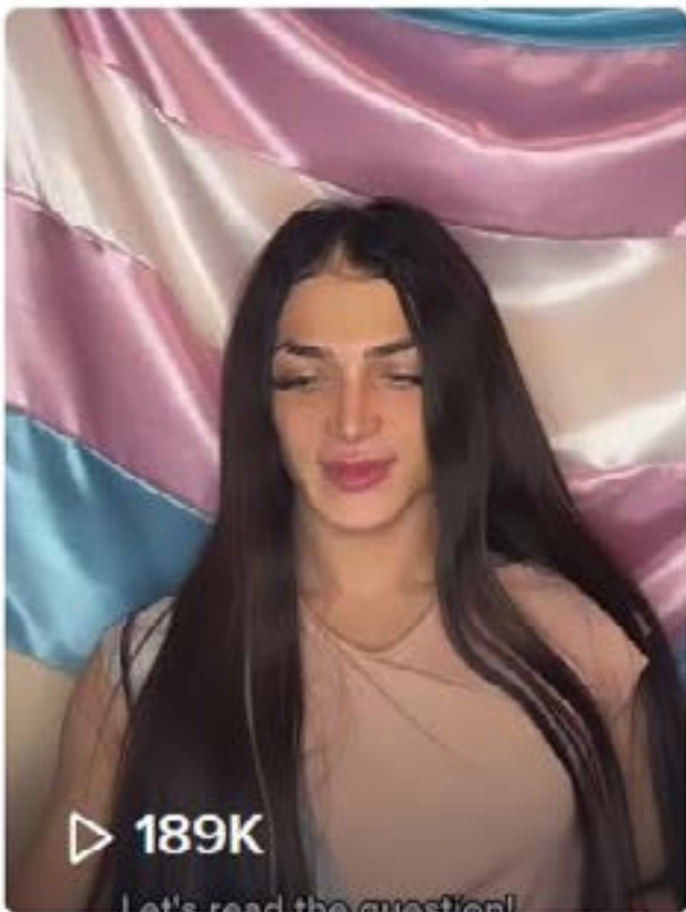
#pride #trans ...

It shows again that we should not be afraid of using new platforms and opportunities in our work.