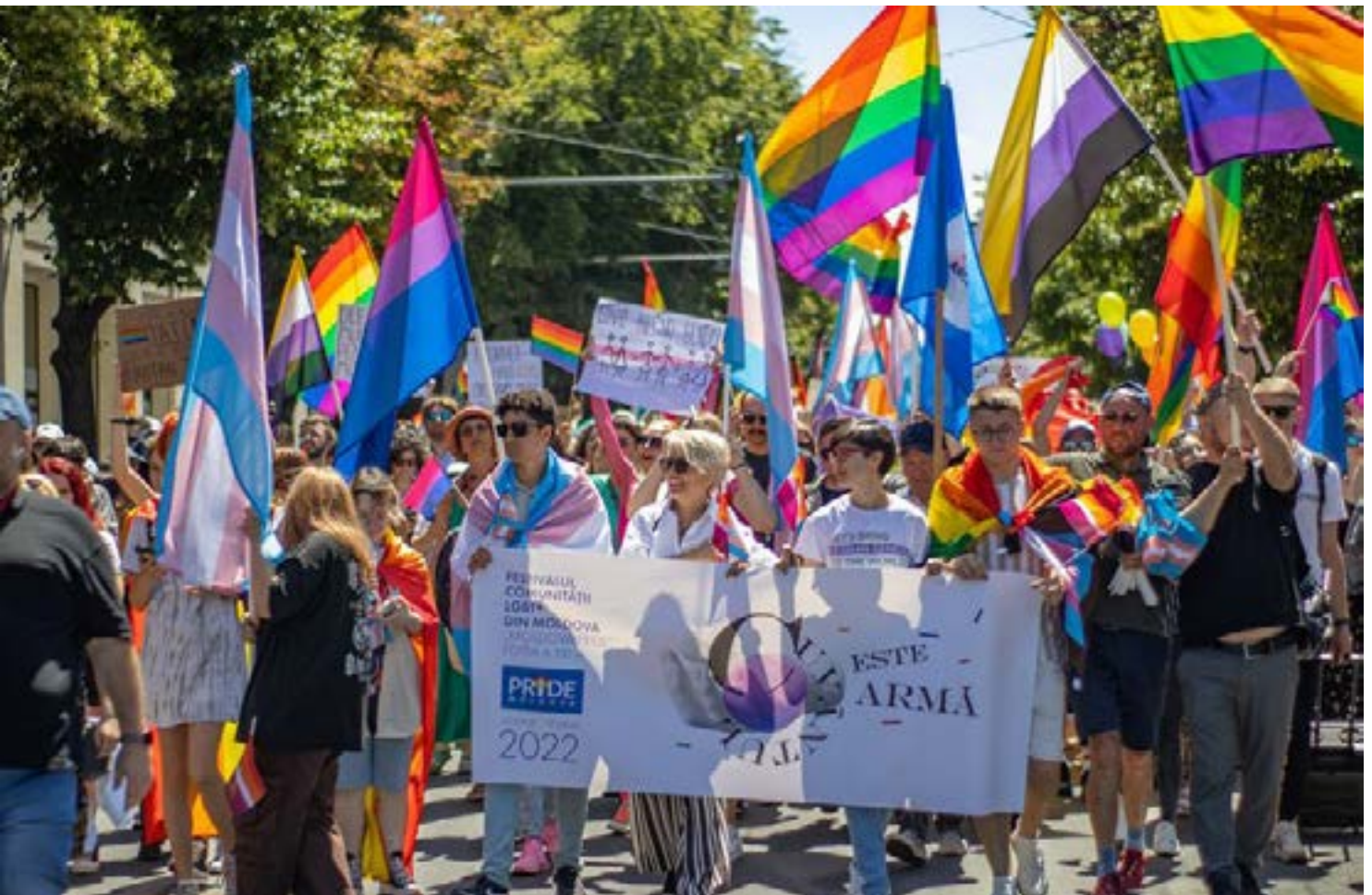
Success Stories of ECOM Members: Best Practices in Supporting the LGBT Community in EECA

This year's march was also marked by another record: six members of the Parliament of Moldova attended the event.